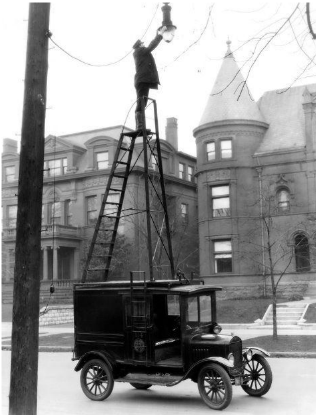
This was the approved way to change the street lamps in 1910. Cool!