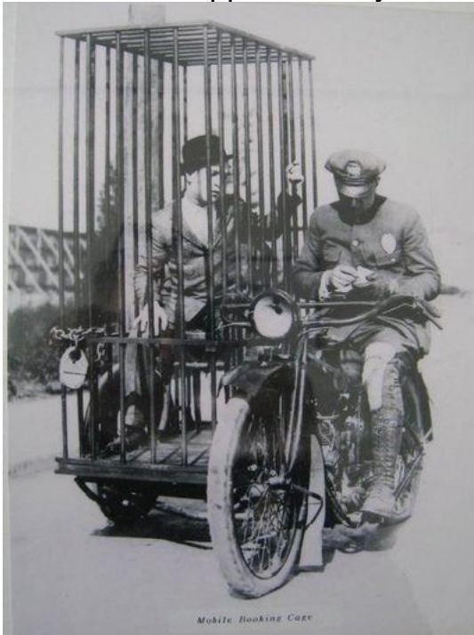
A single Paddy Wagon. Never knew they had such a vehicle!