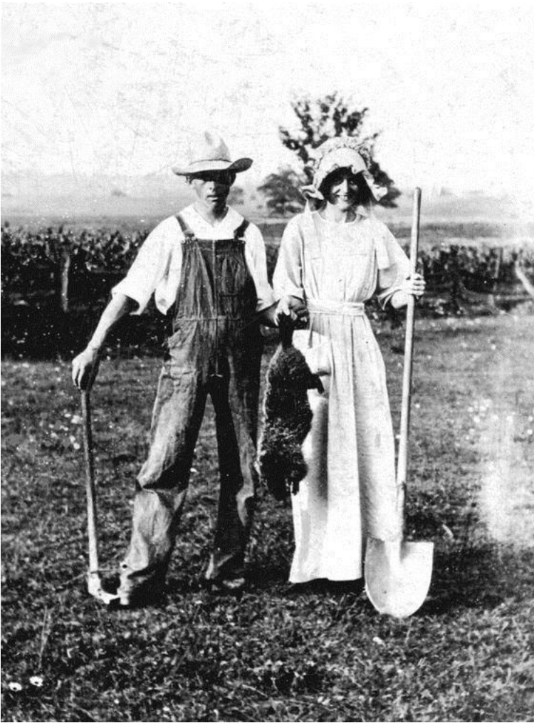
This couple pose in an early version of American Gothic, with a groundhog killed on their Manchester farm. It's dinner! Note: Photo taken circa 1914, from a family photo album