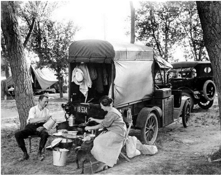
Camping out in 1918