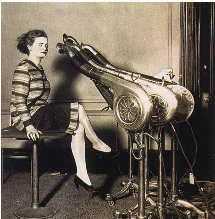
A hair dryer in the 1920 Salon. What a contraption!