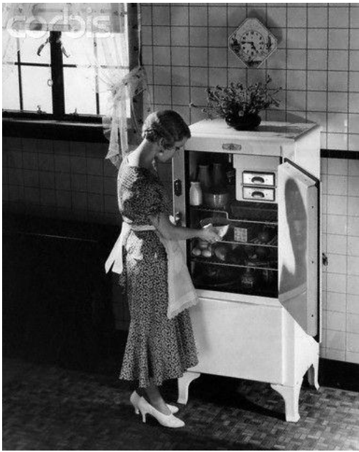
This is a 1920's refrigerator. Only the elite could afford such a thing and most still had the old ice boxes.