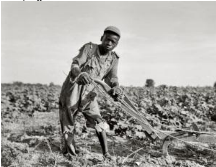
This was the 30's, and this sharecropper's son was working behind the plow, barefoot and all. You can bet there was a mule on the front of that plow