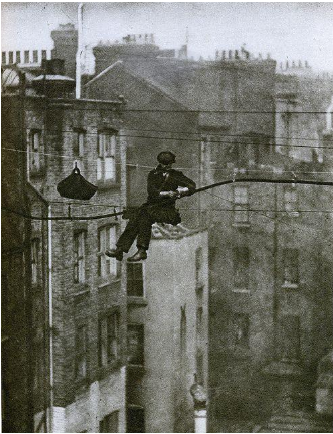
London, in the 1920's, this was a telephone engineer. What a job! (How was he suspended? It looks like he has a rope or cable around his neck – you don't dare fall unless you want to be hung!)